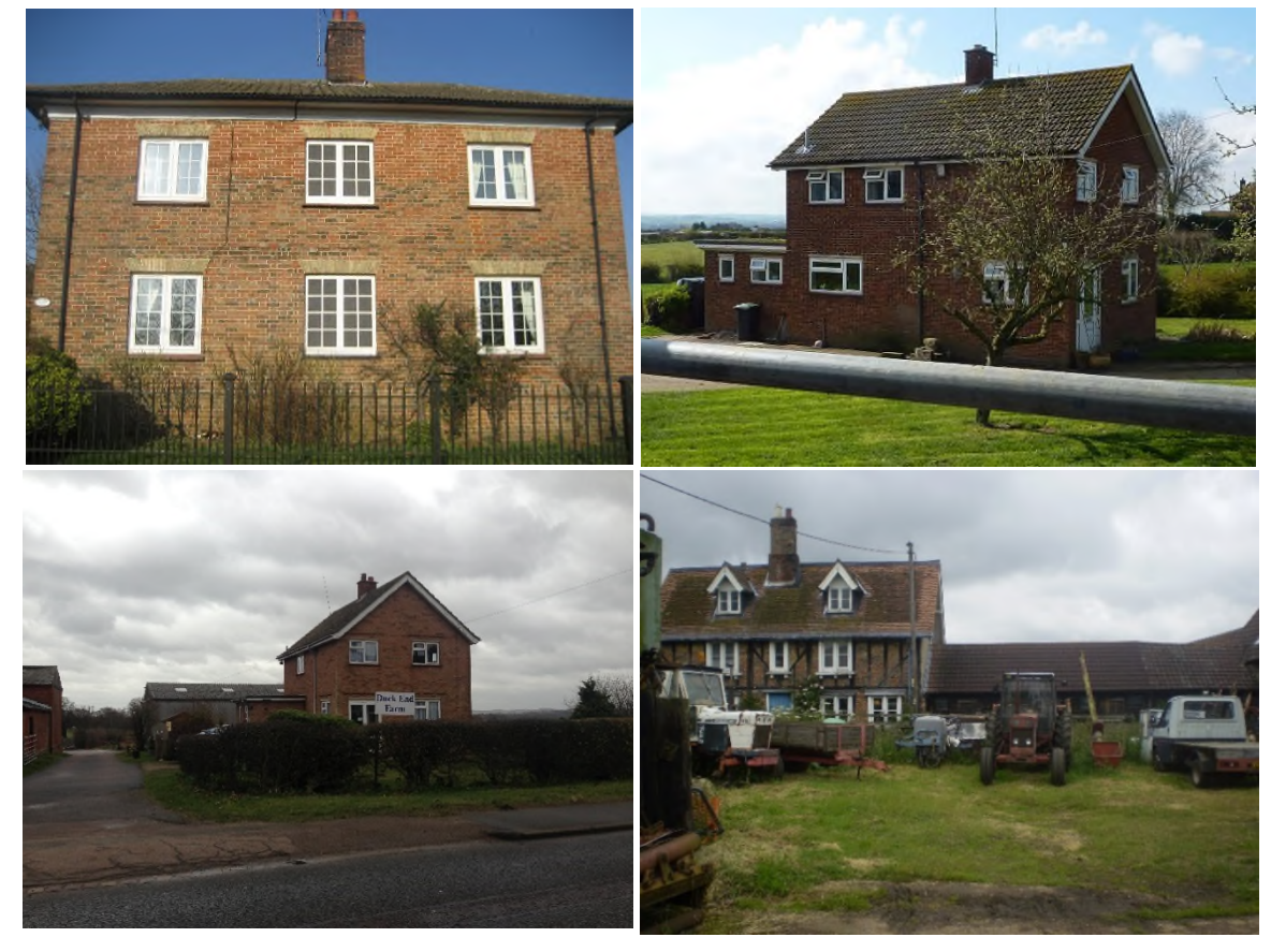
Top left: Five-bedroom house, split into two properties, Top right: Detached three-bedroom farmhouse, Bottom left: Detached three-bedroom farmhouse, Bottom right: Grade II listed two-bedroom farmhouse