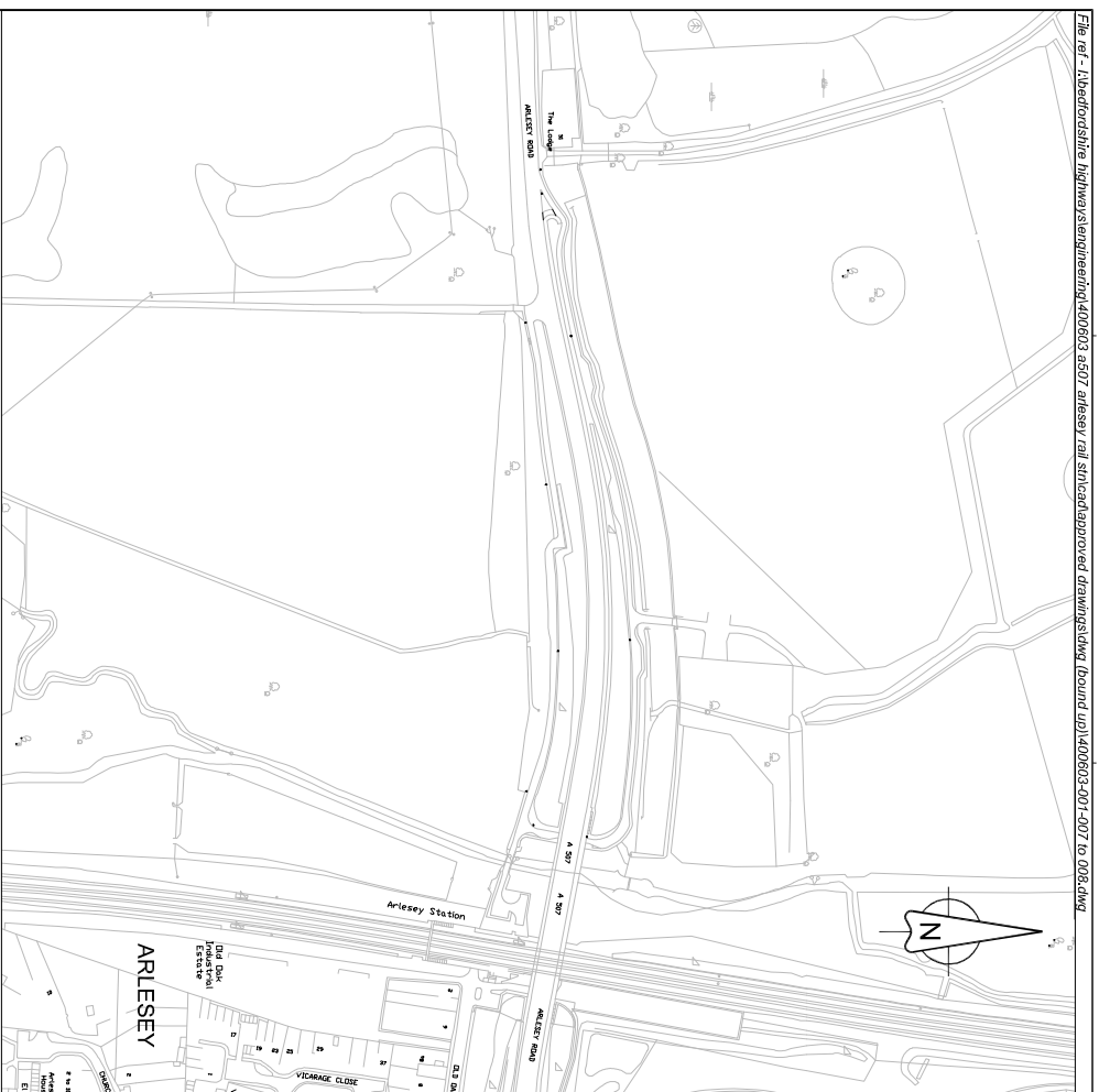
Location Plan Scale 1:2500